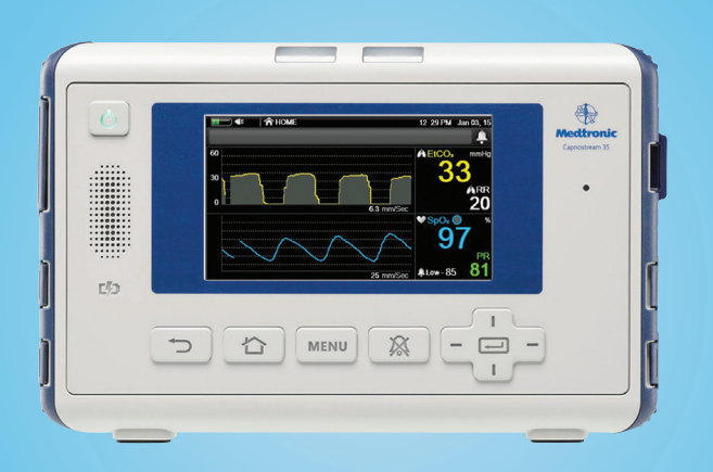
Capnostream<sup>™</sup> 35 Portable Respiratory Monitor