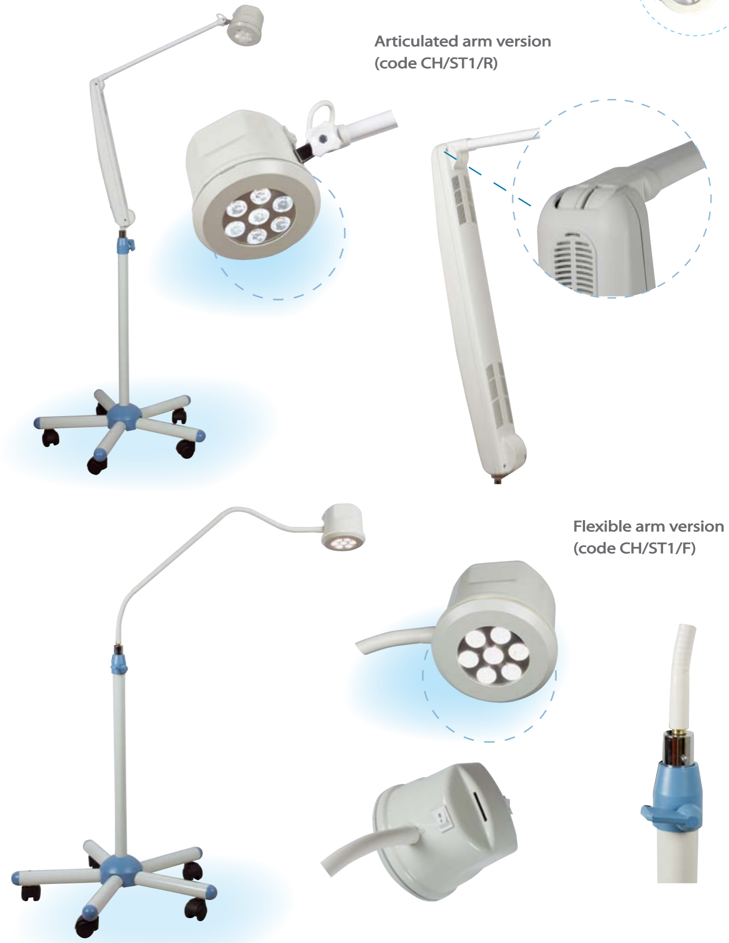
Articulated arm version (code CH/ST1/R)